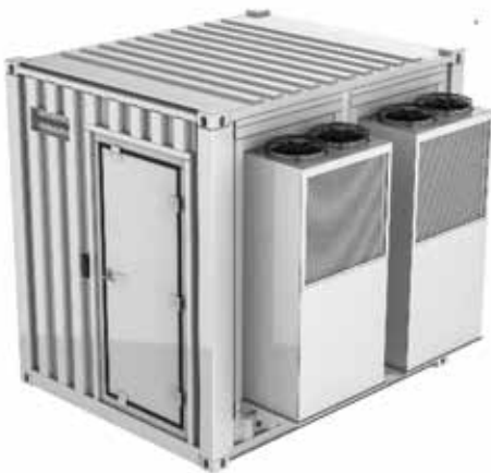
10F CONTAINER DATA CENTER