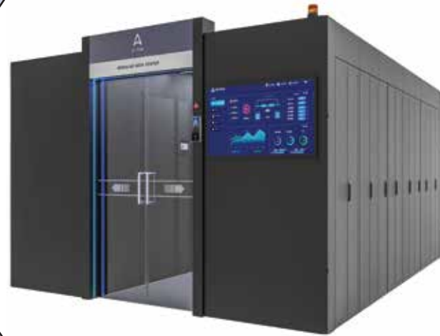
CONTAINER DATA CENTER – INDOOR TYPE